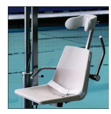
HEADREST & FLIP-UP ARM