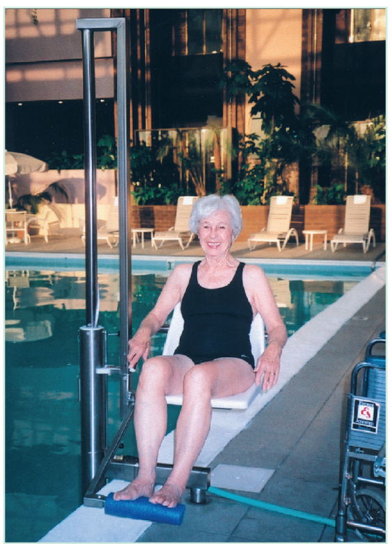
U.S. Patent # 5,465,433 Model IGAT-180 is compact and easy to remove and replace with no tools. The seat rotates 180° clockwise into pool. Lifts 400 lbs. at 55-65 PSI.