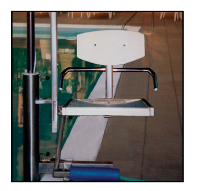
EXTRA-WIDE TWO-PIECE SEAT