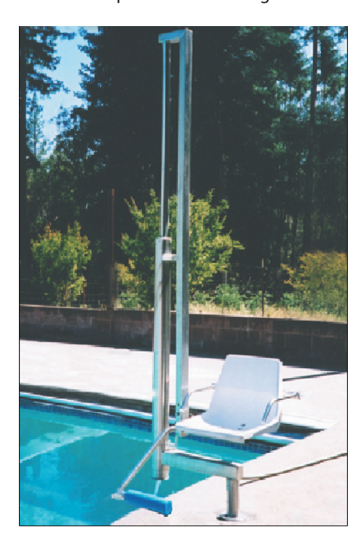
Model IGAT-180 AD (Above-Deck) is designed so the entire lift is out of the water until the seat enters. This is desirable for swim events, or for pools with automatic covers or raised copings. Lifts 350 lbs. at 55-65 PSI.

Options include flip-up outer armrest, full support headrest, additional seat belts, blue seat, vinyl liner wall pad, heavy-duty seat, rescue board, and stretcher. Inquire when ordering.