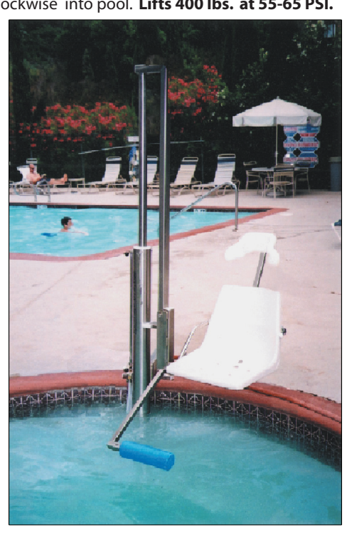
Model IGAT180/135 features an automatic 135° seat turn to accommodate benches in spas. Portable – Lifts out and rolls away with no tools. Lifts 400 lbs. at 55-65 PSI.