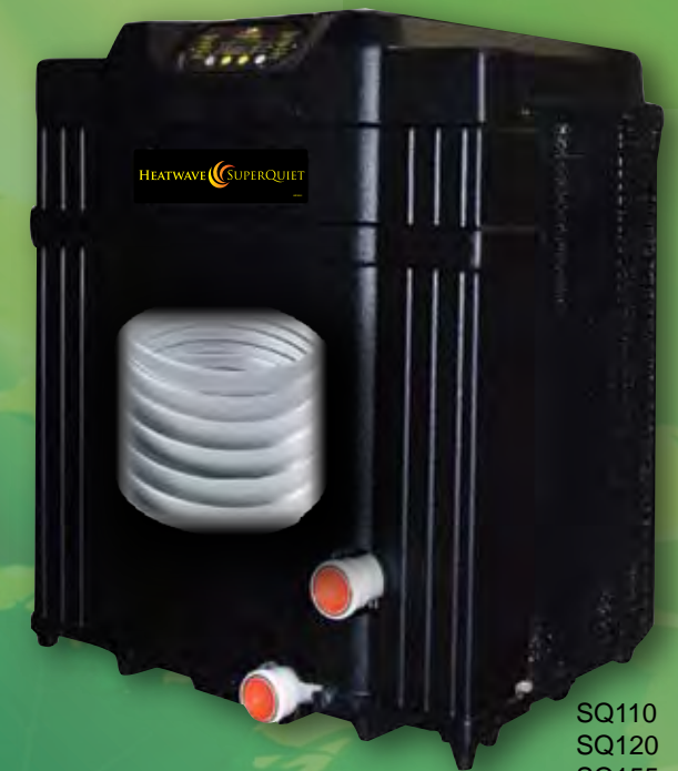
SQ110 SQ120 SQ155 SQ175