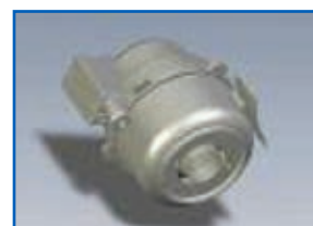
Air inlet at the bottom of the Silencer® creates a tortuous path, trapping noise inside the blower