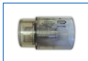
Durable spring check valve included with each Silencer®

Friction fit for 2" PVC pipe or fittings