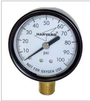
IPPG or IPG Series