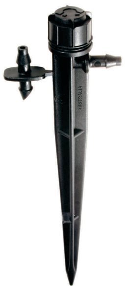
Mini Bubbler Spike Inlet 0.16"