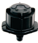
Mini Bubbler Thread 10-32 UNF