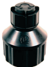
Mini Bubbler Thread 1/2" Female