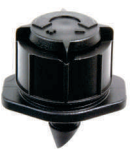
Mini Bubbler Barb 0.16"