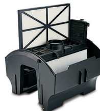
Filter removes easily from filter frame