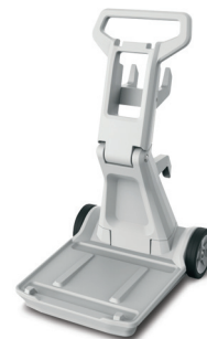
Universal Caddy Cart makes moving and storing the cleaner quick and easy