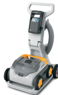
One Complete Cleaner Kit (RC3432AUy) includes Caddy Cart