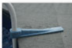
Resin flange secures step to deck.