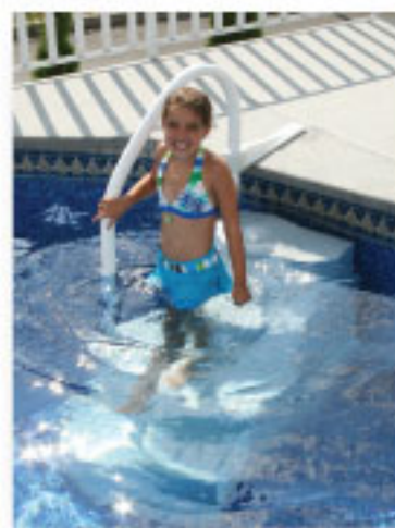
Duke step shown in White Granite