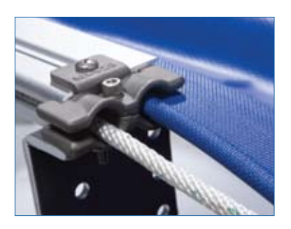
Stainless Steel Cover Guides: 2 piece stainless steel guide feed, heat-sealed commercial webbing with optional color matched webbing. 3500 pound high tensile, non-stretch ropes are the strongest in the pool cover industry.

Stainless Steel Mechanism: The stainless steel mechanism frame stands up to the harsh pool environment where water and pool chemicals can cause corrosion.