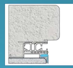
Formed Concrete Cantilever (2 Piece)