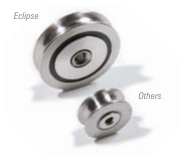
2" Stainless Steel Pulleys: Heavy-duty, double-row, sealed, stainless steel ball bearing pulleys provide five times the load bearing capacity of commonly used pulleys for uncommonly long life and greatly reduced rope wear.