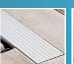
Many different lid options are available to enhance the design of your pool.