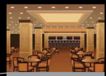
Restaurants: Our fast setting, low odor MiraFlor solutions minimize downtime and service interruption. Environmentally friendly systems have low, or zero-VOC, while providing excellent protection of elaborate decorative finishes in food service areas visible to the public.