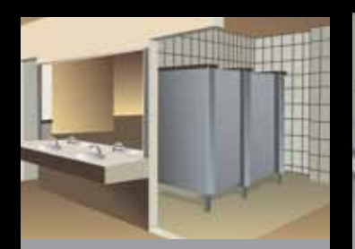
Restrooms/Locker Rooms: Mira-Flor system provide a slip resistant surface that resists bacteria build-up and withstand heavy traffic and repeated scrubbings with harsh detergents and hot and cold flushes.