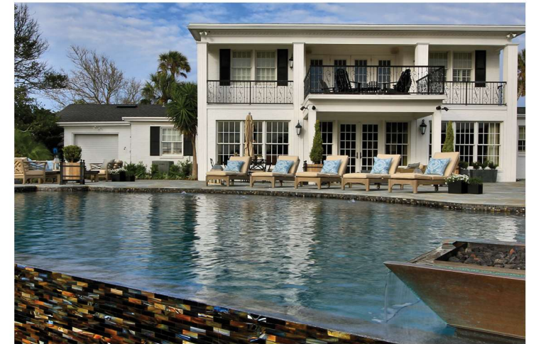
Hydrazzo Classico Oceana Laguna

Hydrazzo® Classico is a one of a kind polished marble pool finish. Hydrazzo was the first polished finish in the industry, and it has set the premium standard in pool finish innovation. With a silky smooth texture (the smoothest of all CL Industries' products) and a natural variegated appearance, this finish complements all poolscape designs. Hydrazzo® Classico adds colored glass accents to the original formula. All Hydrazzo products are known for timeless beauty and easy maintenance in any domain.