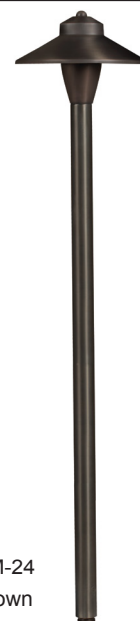
CL-653B-GM-24 24" Stem shown