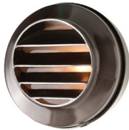
CL-342B AB, BR, GM & SI