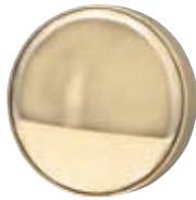
CL-343B AB, BR, GM & SI

1- These fixtures are designed to surface mounting.