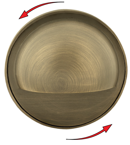
Twist To Lock Function Tool Free relamping.