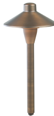
CL-649B-AB-12 12" Stem shown