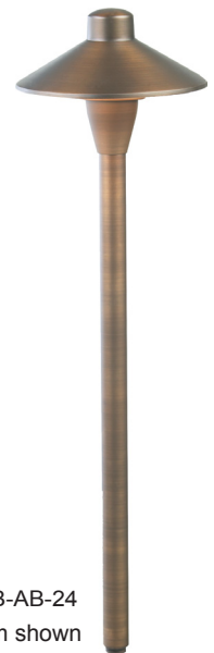
CL-649B-AB-24 24" Stem shown