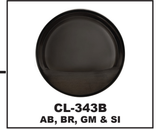
CL-343B AB, BR, GM & SI