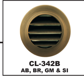
CL-342B AB, BR, GM & SI