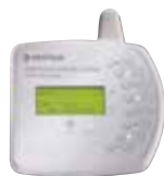
EasyTouch System Wireless Controller