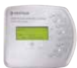
EasyTouch System Indoor Control Panel (for 4 or 8 function control)