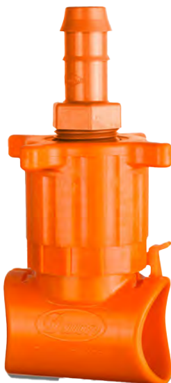
KwikTap™ Saddle with Drip Adapter