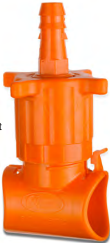
KwikTap™ Saddle with Swing Straight Adapter