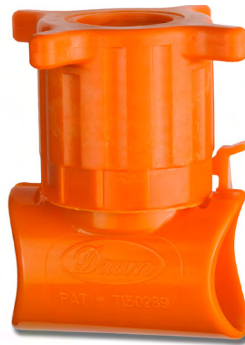
KwikTap™ Saddle 1/2" or 3/4" FPT