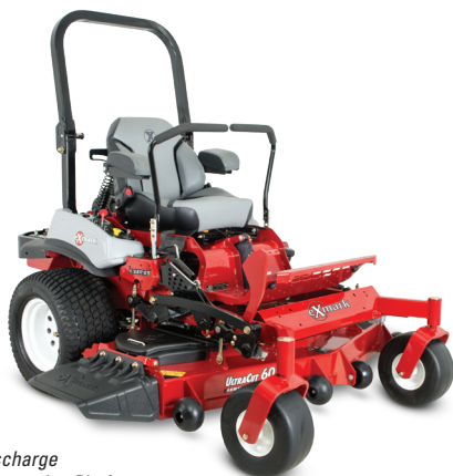
Side Discharge with Suspension Platform