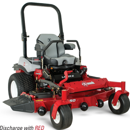
Rear Discharge with RED