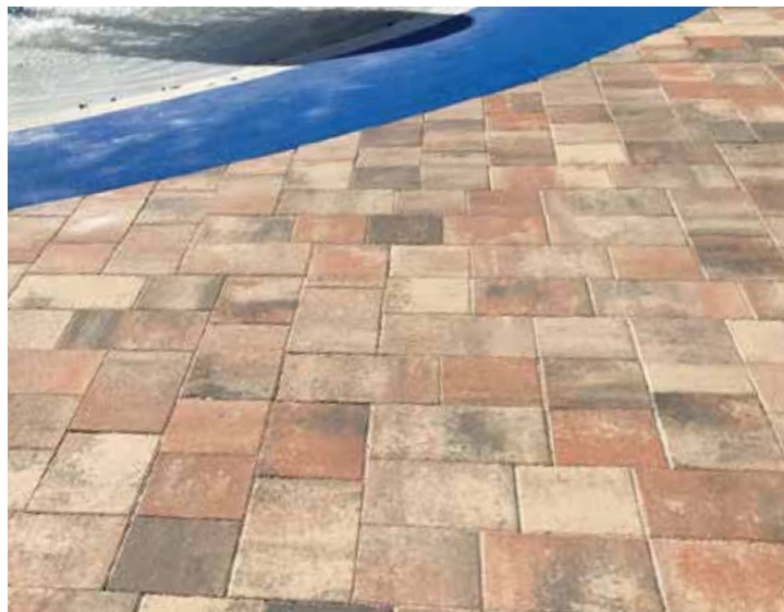
Traverstone in Cream / Orange / Pewter, Random Pattern