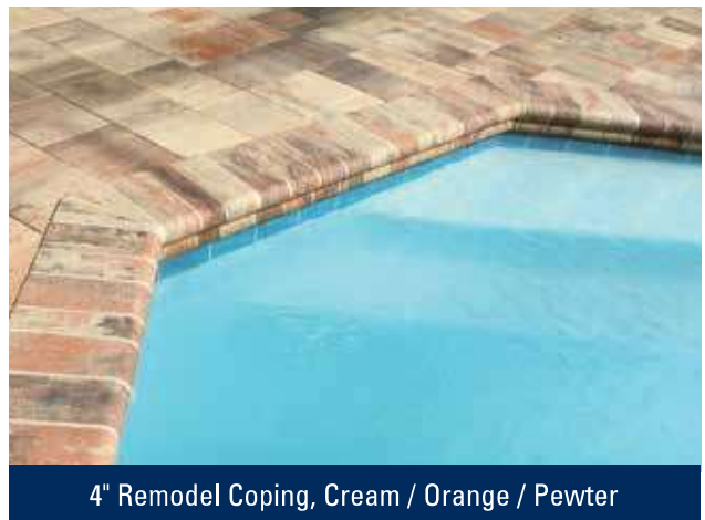
4" Remodel Coping, Cream / Orange / Pewter