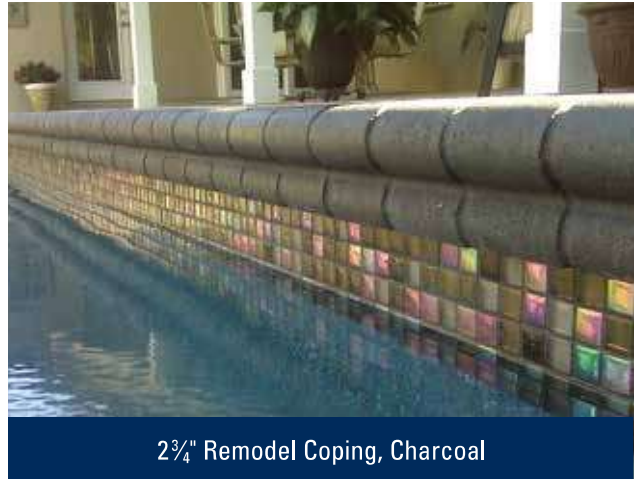
2 3/4" Remodel Coping, Charcoal

Use for pool coping or step coping to overlay existing hard surfaces.