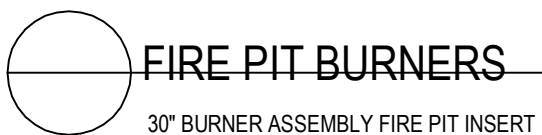
30" BURNER ASSEMBLY FIRE PIT INSERT