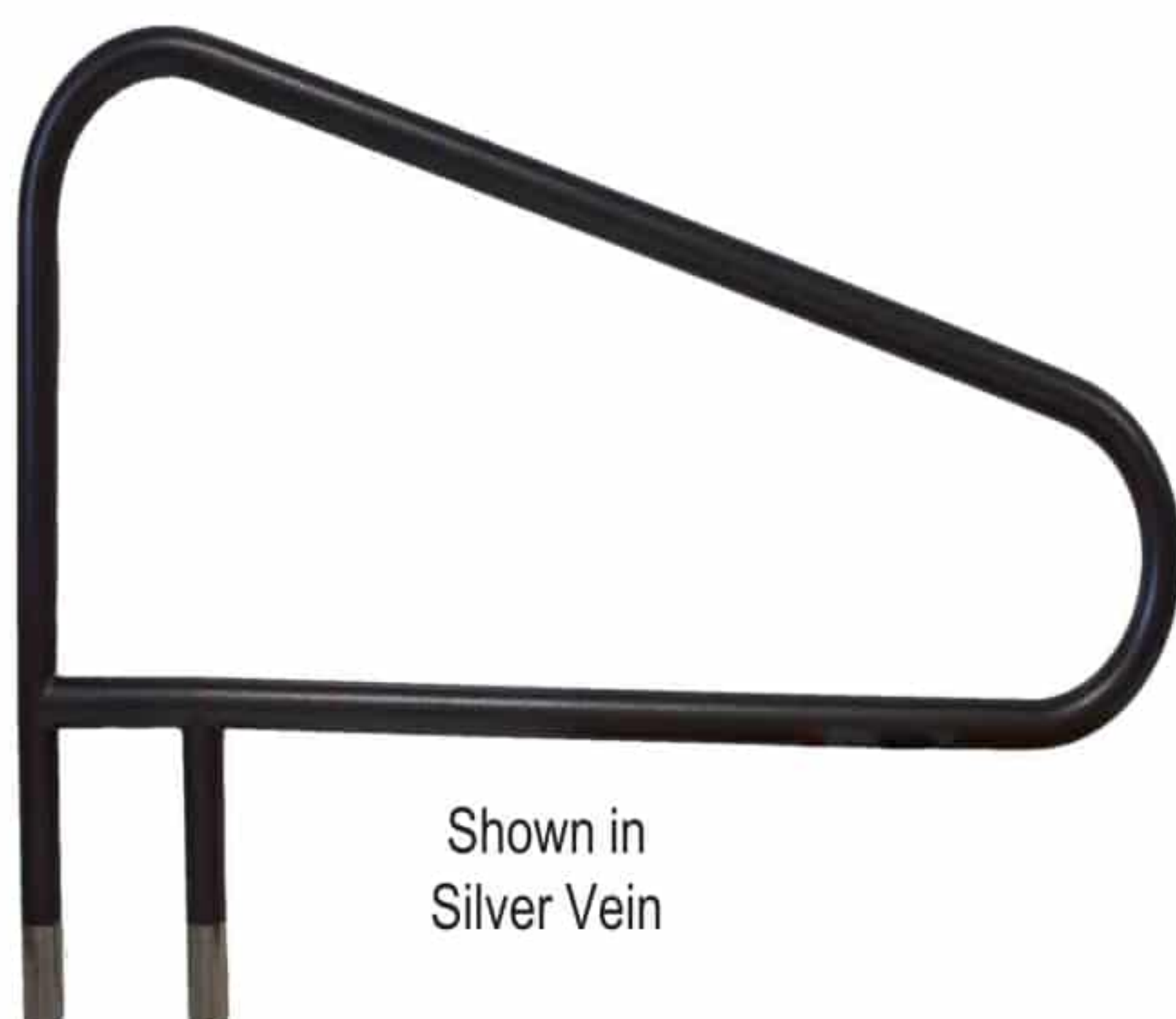
Shown in Silver Vein