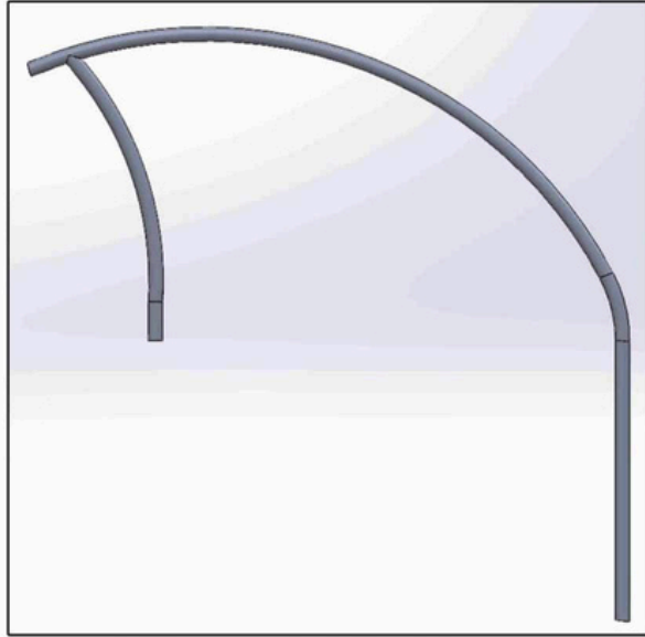
MODERN 4' STAIR RAIL