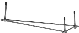
3 Bolt Jig for 3 Bolt Base with 8' GX Board