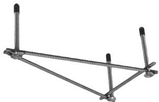
3 Bolt Jig for 3 Bolt Base with 6' GX Board

To select a color for board or base, add corresponding color code to the end of the part number above. To order 3 bolt base with NO JIG, replace "3B6" with "3B6NJ" or "3B8" with "3B8NJ".