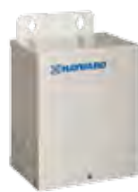
Wall Mount Transformer