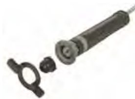
Installation Tool Included SKU #SP0536CTOOL