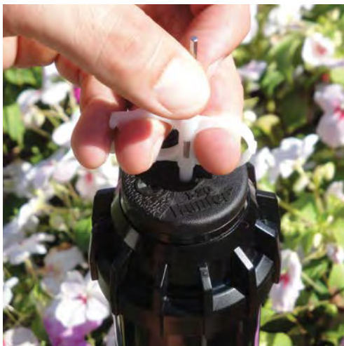
I-20 can be turned off at the head if needed

Overall Height: 17" Pop-up Height: 12" Exposed Diameter: 1¾" Inlet Size: ¾" female NPT