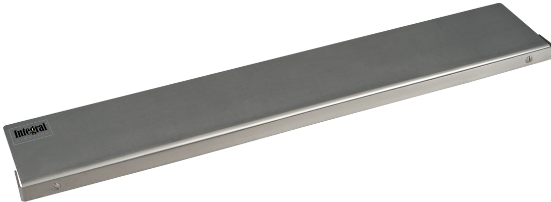
IL18.250 Clay finish shown