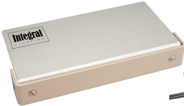
IL6.375 Sand finish shown with Xenon lamp