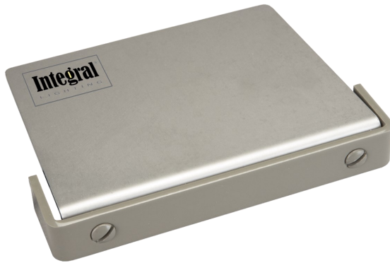
IL4.250.500 Clay finish shown