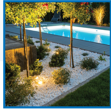
General Purpose Auxiliary Loads