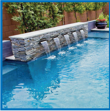
ON/OFF Pump Control