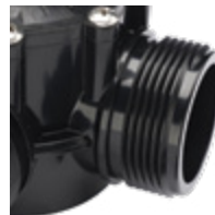
1 1/2" SLIP / 2.5" MBT CARVIN union