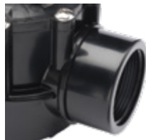
1 1/2" FNPT / 2" SPIGOT