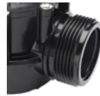
1 1/2" FNPT / 2.5" MBT CARVIN union