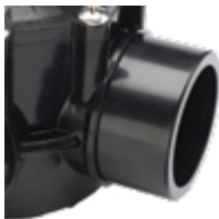
1 1/2" SLIP / 2" SPIGOT