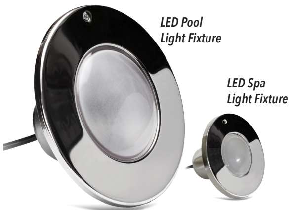
LED Pool Light Fixture