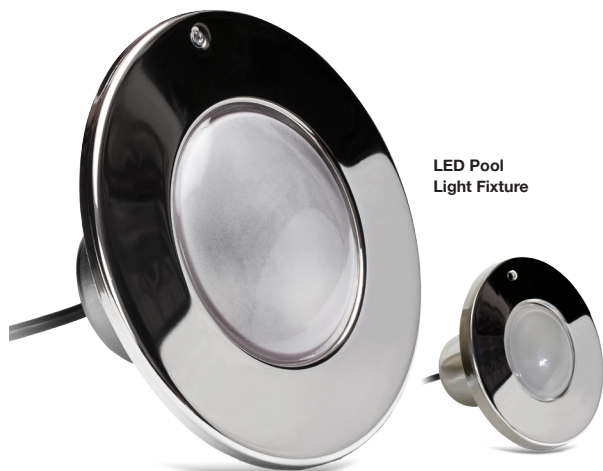
LED Pool Light Fixture

*HI Series compared to incandescent lamps **Compared to incandescent lamps