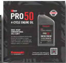
Window Decal (Back)