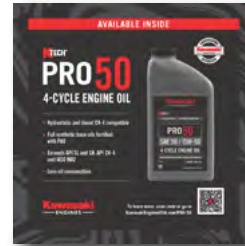
Window Decal (Front)