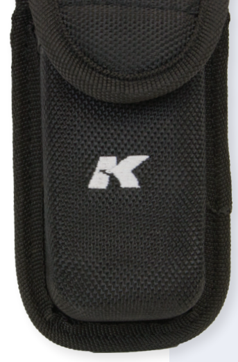
Carrying case included