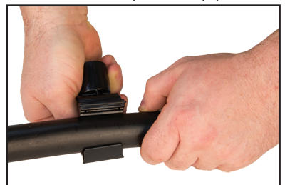
SLIP saddle onto pipe BEFORE LATCHING.

Note: Do not install tap into saddle until saddle is in place on pipe.