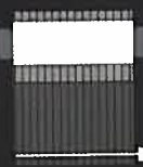
Extra Fine Cartridge 50 micron