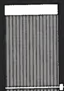
Standard 250 micron

INCLUDES 3 FILTER BAGS: Standard & Fine: W25 x H52 cm Cartridge: W25 x H25 cm