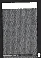
Fine 75 micron