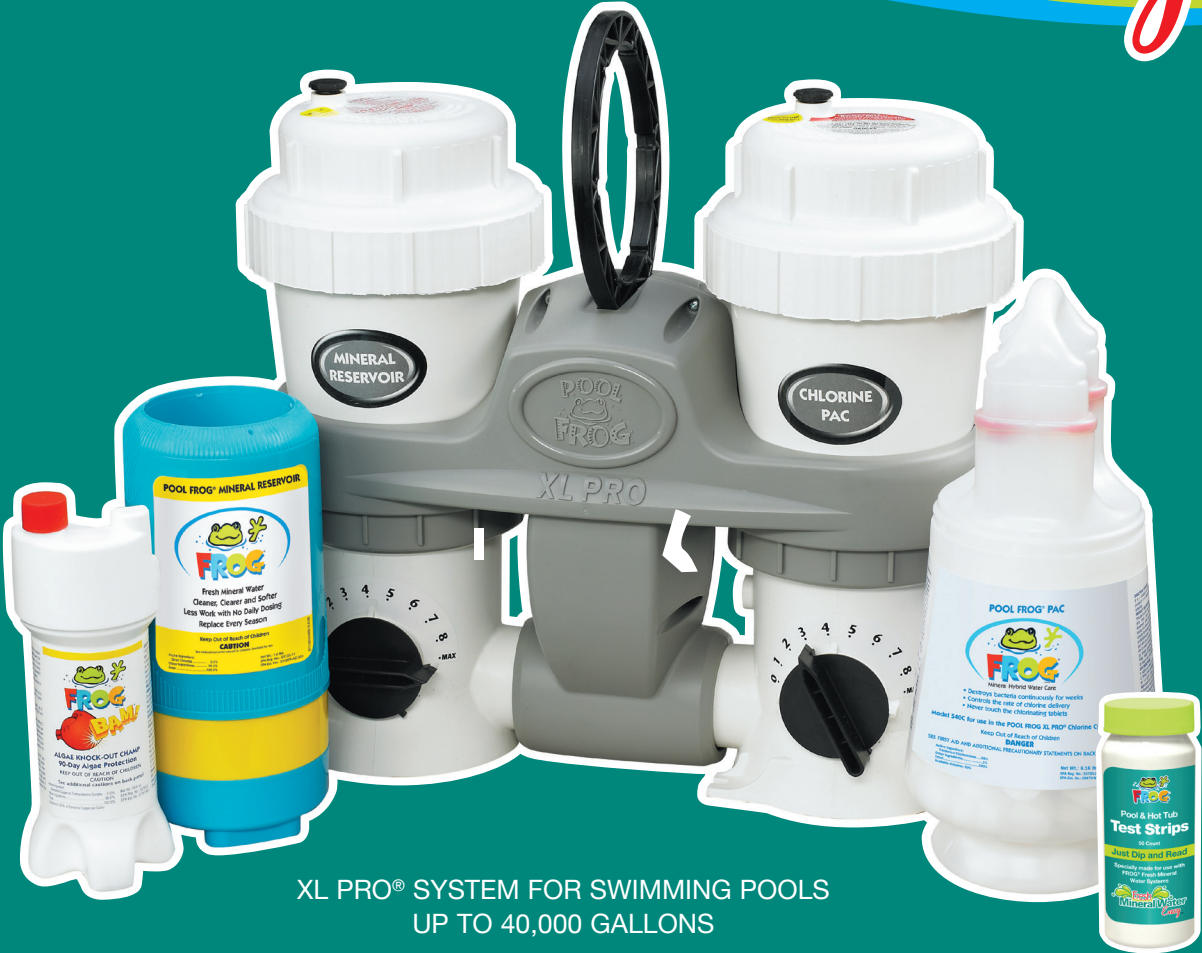
XL PRO® SYSTEM FOR SWIMMING POOLS UP TO 40,000 GALLONS

Cleaner, Clearer, Softer. It's Easier too!