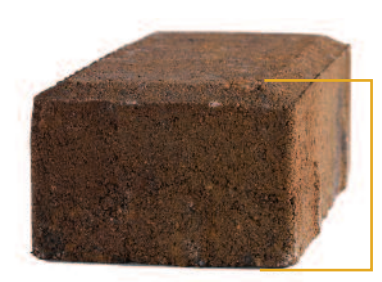
1.77 inches 45 mm

5½ x 8¼", 5½ x 5½", 23/8 x 5½" all pavers 45mm thick