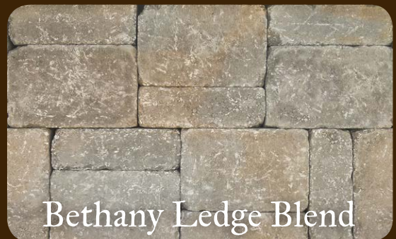
Bethany Ledge Blend