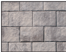
GRANITE CITY BLEND