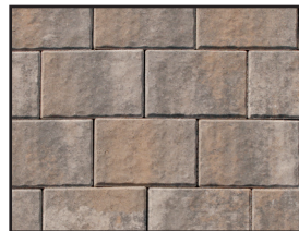
SOUTH BAY BLEND*