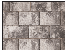
GRAPHITE PEARL BLEND*