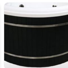
Stainless Steel Banding (only available on round models)