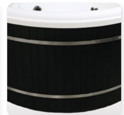
Stainless Steel Banding (only available on round models)