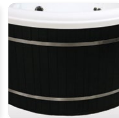
Stainless Steel Banding (only available on round models)