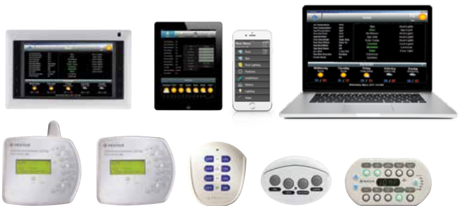
Photos show range of control devices available to interface with EasyTouch systems—wired, wireless, push-button or touch screen—all are extremely easy to use.