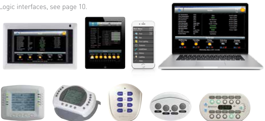
Photos show the range of control devices available to interface with IntelliTouch systems—wired, wireless, push button or touch screen—all are extremely easy to use.

For an overview of all the available ScreenLogic interfaces, see page 10.