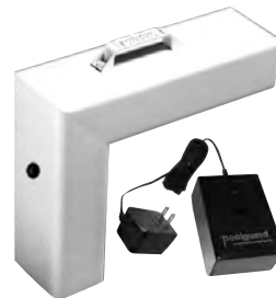
IN GROUND POOL ALARM WITH REMOTE RECEIVER