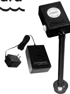
ABOVE GROUND POOL ALARM WITH REMOTE RECEIVER