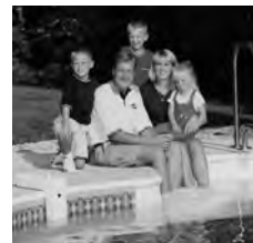
Poolguard's Family of Products Helps Protect Your Family!