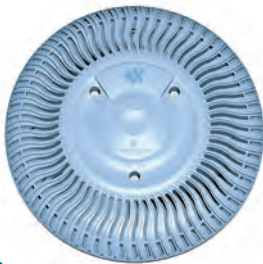
MDX 2 ANTI-ENTRAPMENT DEBRIS DRAIN