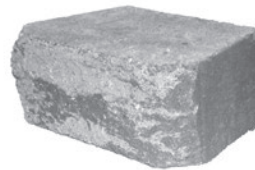
#838 - RockFace Unit

Before specifying a specific product, please confirm availability with your local Keystone Hardscapes producer.