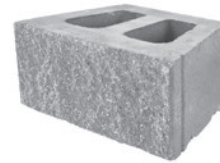
#827 - Straight Unit

Before specifying a specific product, please confirm availability with your local Keystone Hardscapes producer.