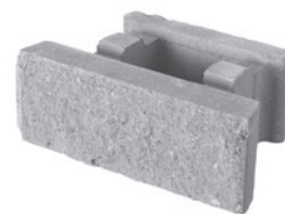
#771 - BroadStone 8in RockFace

Before specifying a specific product, please confirm availability with your local Keystone Hardscapes producer.